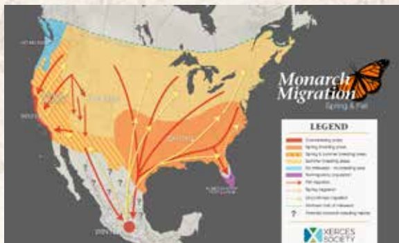
Monarchs feed and breed in Georgia on both the north-bound spring migration of the eastern population as well as the return trip to Mexico in the fall.

What's happened? There are many suspects, including loss of host plants, destruction of habitat, climate change, and increased pesticide use. While any one of these factors could be problematic, taken together they may spell doom for Monarchs. These butterflies are the proverbial “canary in the mine.” Their troubles are our troubles, warning of danger to the health and well-being of humans as well as plants and other animals.